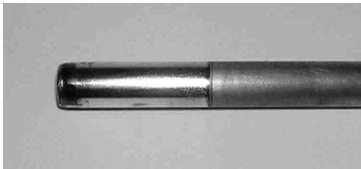
Figure 3—Aluminum deposited on a mild steel rod. 6

It also may be feasible to deposit silicon, germanium and gallium arsenide from ionic liquid electrolytes, 6 which certainly cannot be done from aqueous electrolytes.