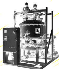
Titan Final Polishing Filter

Ask for your FREE copy of our latest catalog