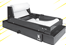
Automatic Disposable Fabric Filter

Our products are designed for ease of use with the latest digitally controlled operations