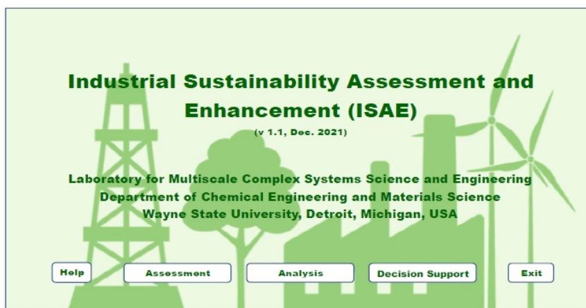
Figure 1 - Home screen design of the ISAE tool.

In the 7th quarterly report, we described our initial effort on the development of a computer-aided prototype tool, named the Industrial Sustainability Assessment and Enhancement (ISAE) tool. That report included two screenshots shown in Figs. 1 and 2. In the 8th quarterly report, we reported that we hired an undergraduate senior student, who was guided to help develop a number of modules for sustainability assessment. The tool is currently able to assess a process' sustainability performance, after a set of sustainability indicators are selected, and plant data are input.